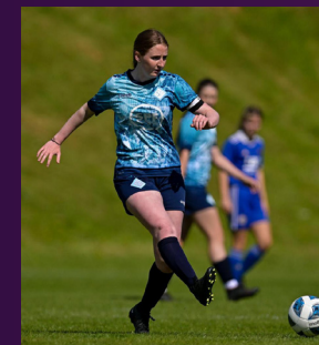
Libby Homes London City Lionesses